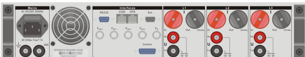
Rear panel of RS 2330