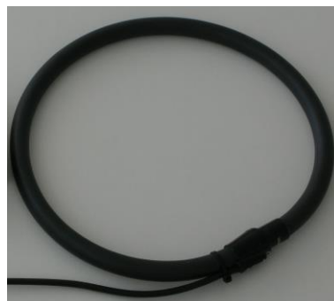
Flexible Current Probe 6000 A FCP 3x21