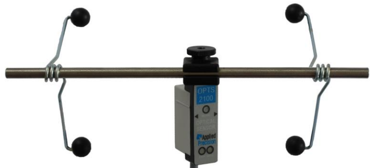
Optical Sensor OPTS 2100 with its Fixing Clamp OPFC 1000