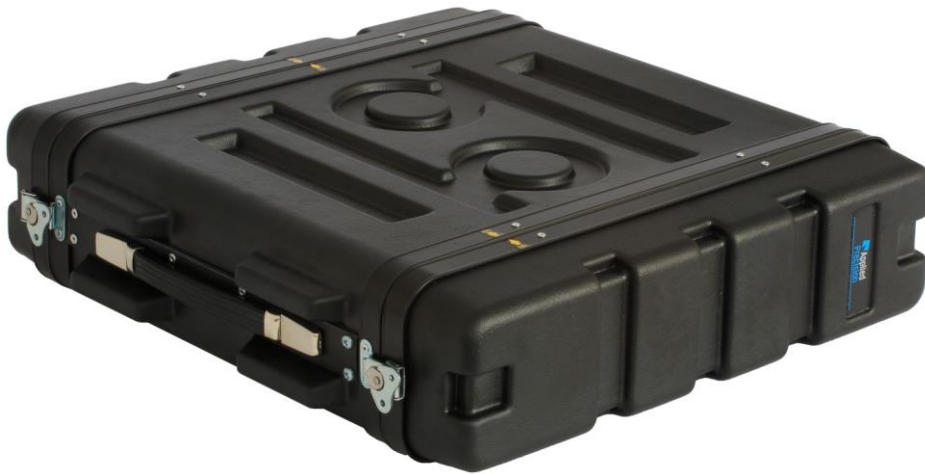
Transport Case RSTC 1000